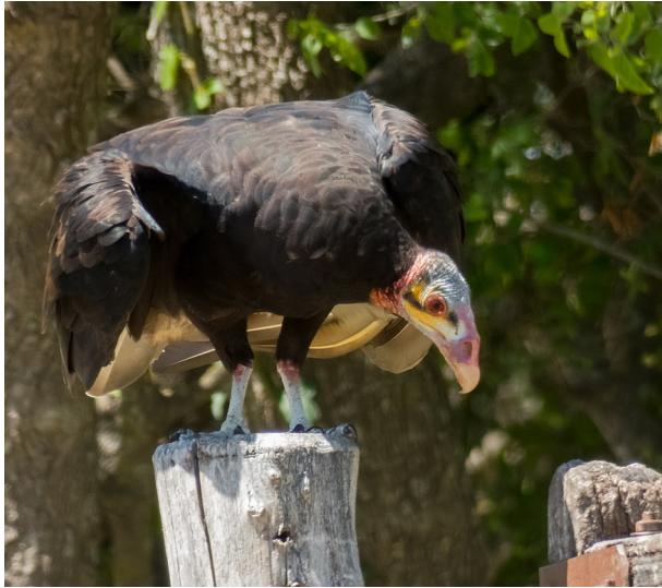
Figure 2. Lesser Yellow-headed Vulture ( Cathartes burrovianus ) observed on 8 January 2018 in Estancia Luis Chico, Punta Piedras, north-eastern Buenos Aires province, Argentina (photograph by MAC).

are some recent records from online databases, such as eBird ( https://ebird.org/ ) and EcoRegistros ( https://ecoregistros.org/ ) for Entre Ríos and Buenos Aires provinces, and also for southern Uruguay, suggesting that the range of this species may be extending south from its traditionally known distribution (Fig. 1). All these records together undoubtedly show a scarce but regular presence of this species in areas far south of its published range.