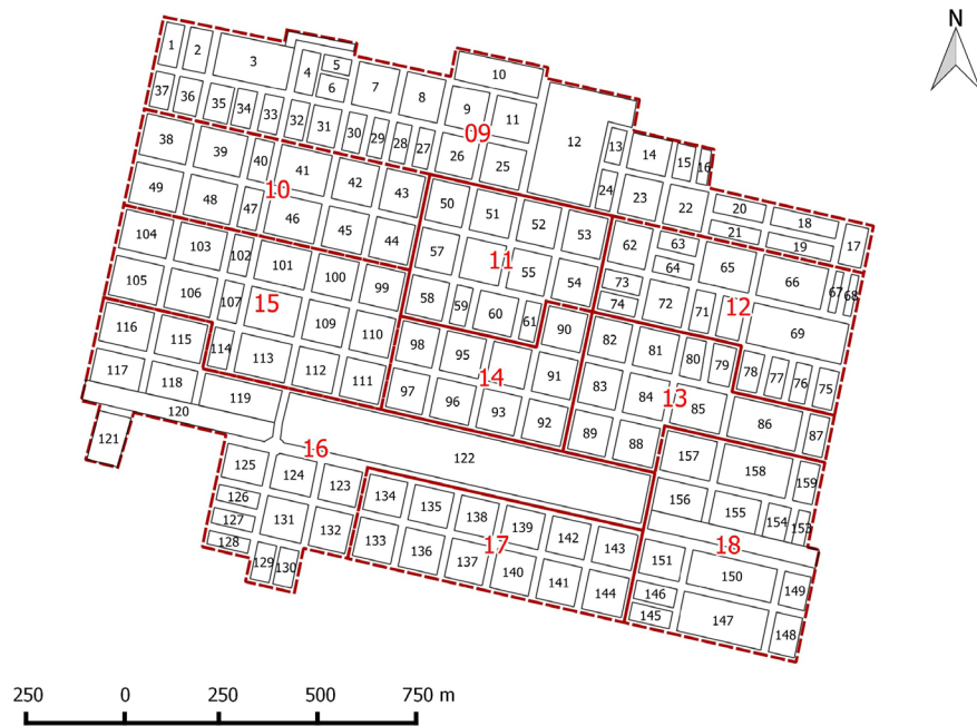
Figure 1. Map of the Census Radius of Monte Maíz by National Institute Census divides the town into nine sectors outweighed demographically, from in number 9 to number 18.

from cancer in the last year and the past 5 years), for criteria of Globocan 2012 [6], these three were dependent variables, while sex, age, occupation, stay in the village, smoke, ratio census residence, educational level and the presence of environmental contaminants were the independent variables.