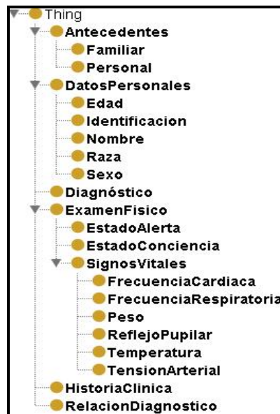
Figure 3. Levels OGHC Ontology

In Knowledge management, some classes of ontology as race “ EstadoAlerta ” and “ EstadoConciencia ” (see figure 3) are key criteria for determining possible of preliminary diagnoses if exist case of some very particular symptomatology with characterization that may occur in some populations and cultures.