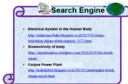
Figure 2. Learning Sites

The item developed was a technique for connecting students with various scientific disciplines to religion. They were also required to master the technology as an initial step of learning in this millennial century. This is one of the advantages of the book developed by the researcher. In addition to the feasibility component of the presentation (technique and construction), the researcher also considered the Practicality component in producing this Basic Integrated Biology book. The aspects of practicality can be seen in the following table 4.3.