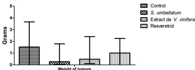
Figure 2. Evaluation of tumor weight (g) ( n=24 )* p<0,05 .

Macerated, extract and resveratrol did not cause an effective antitumor action, due to the absence of significant difference in the comparison between the tumor weights of the two groups and also in the evaluation of the initial and final sizes of the tumors (Figures 2 and 3).