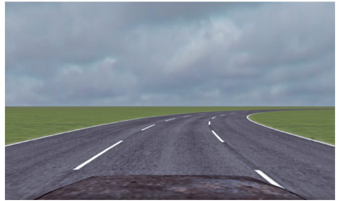
Figure 3. Curve negotiation test as presented in a driving simulator.

Another study compared the relationships between MVCs, SAP, UFOV and the driving simulator in asses-