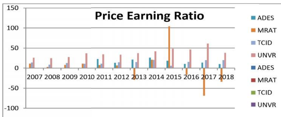
Figure 2 PER Graph in Cosmetics and Household Needs Subsector Companies listed on the Indonesia Stock Exchange in 2007-2018.

The equation can be interpreted if the company's value variable value is 51.715 then profitability is 9.403. If the variable return on assets (profitability) has no value or amounts to 0% then the value of the company has a value of 51,715. Figures generated from these tests can be concluded that return on assets (profitability) affects the value of the company, which means the higher the value of ROA, the higher the value of the company.