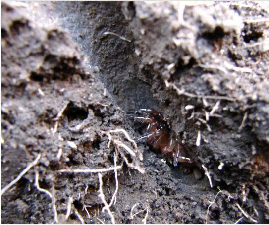
Figure 6. doi