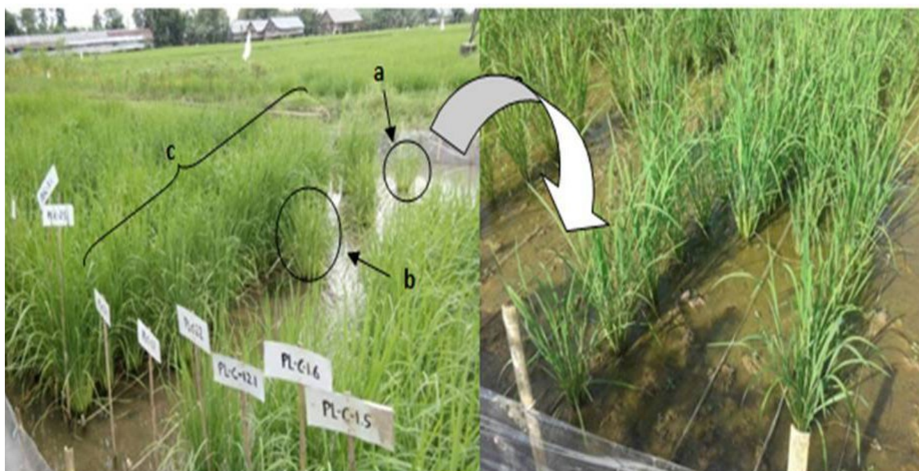
Figure 1. Variations of rice plant phenotypes at 40 days after planting (a) dwarf-type, (b) semi-dwarf type, (c) normal type