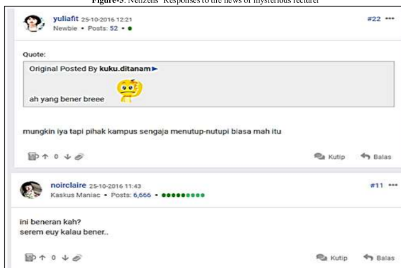
Figure-5. Netizens' Responses to the news of mysterious lecturer