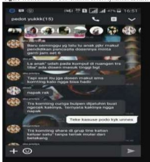
Figure-4. Screenshot of Conversations about Mysterious Lecturer