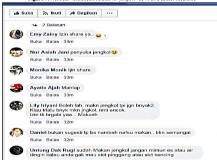
Figure-9. Netizens' comments related to 'jengkol' news as a cancer medicine

news, then a piece of hoax news will not be spread (Coppola, 2002; Malatuny and Salamor, 2017; Walsh, 2006). The following were examples of community responses to this news.