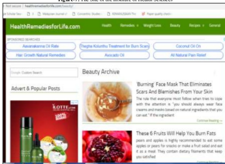
Figure-7. The Site of the Institute of Health Sciences