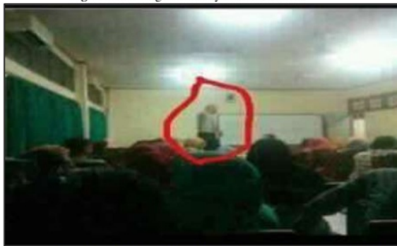
Figure-3. The Figure of a Mysterious Lecturer