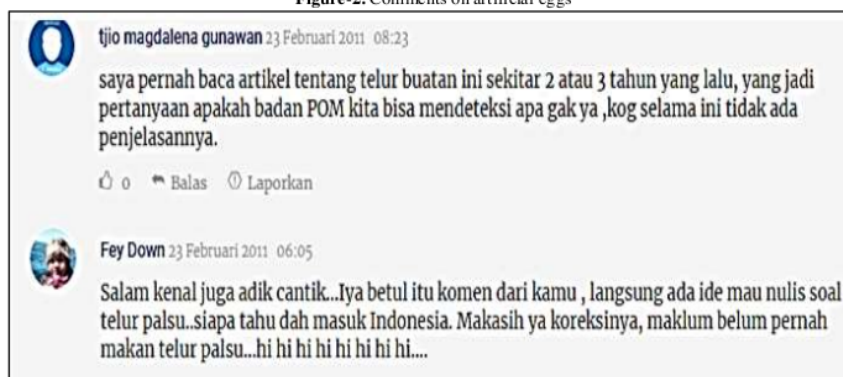
Figure-2. Comments on artificial eggs