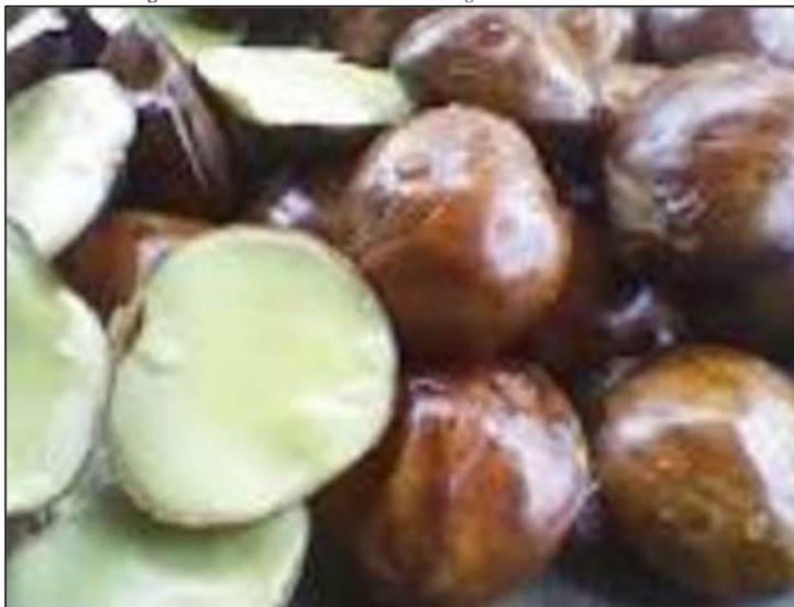
Figure-6. Visual element of the news "Jengkol is a Cancer Medicine"