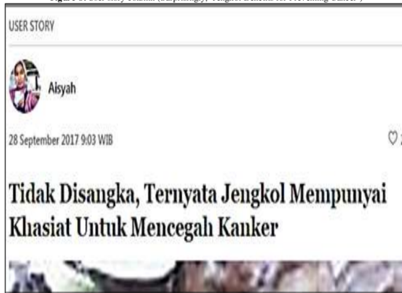
Figure-8. User story column (Surprisingly, 'Jengkol Benefits for Preventing Cancer')