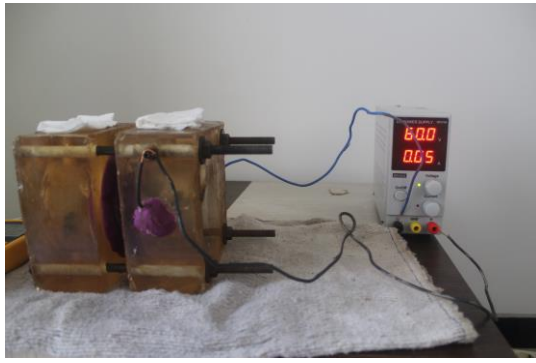
Figure 2. The RCPT Test Set Up

The sample was placed in the pan, which has been equipped with specimen support and tap water. The exposed surface of the specimen was submerged into the water. The water level is 1 to 3 mm above the top of the support device. The scheme of the test, according to ASTM C1585, was shown in Figure 1. The sample was weighed periodically, according to ASTM 1585. To weight the sample, it should be removed from the pan, and the stopwatch was simultaneously stopped. The excess water was removed by using a dry paper towel and quickly weighed. After the weighing process is finished, the sample was placed directly back into the pan. The accumulated water absorbed per unit area was plotted vs. the square root of time ( \sqrt{t} ) in minutes. The initial ( S_i ) and secondary ( S_s ) absorption were calculated by using linear regression and calculating the slope of the graph.