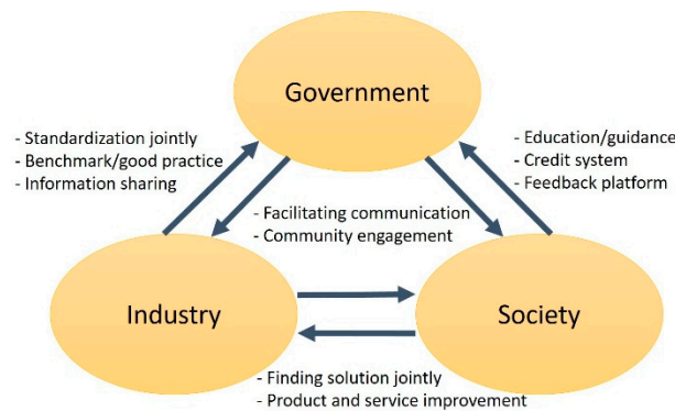
Figure 2. Collaborative governance model.

To generalize the research findings, there are two different forms of government policies. The Hangzhou case represents a gradual movement from the previous hard-law regulation system to collaborative governance. This goes along with the transformation of the public shared bicycle sector towards a combination of public and commercialized shared bike systems. In Nanjing, the original model is self-regulation without interfering from the government. With problems occurring, there is a change from purely self-organization to higher degrees of government control and guidance. The difference reveals that policy and governance approaches should be reconfigured according to the maturity stage of the industry, resource availability, market demand and many other factors.