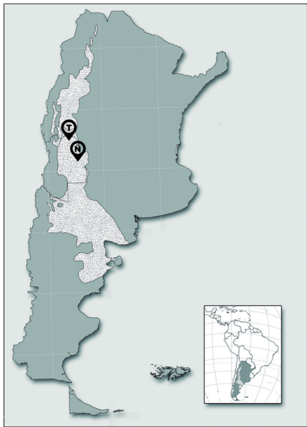
FIGURE 1: Map showing the biogeographic province of the central Monte Desert (shaded) in terms of Argentina and South America. T = Telteca Natural Reserve (32°23'27''S, 68°01'30''W, 540 meters above sea level [masl]); N = Nacuñán Biosphere Reserve (34°03'0''S, 67°58'0''W, 583 masl).

(Kuznetsova et al. 2017) in R Ver 3.3.2, 2016. The AChE activity was used as the dependent variable and the site as a random variable. InfoStat software Ver 2016 was used to design the graphics.