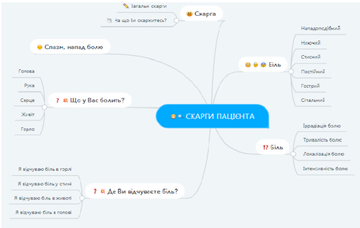
Fig. 2. The Mind Map «Complains of the patients»