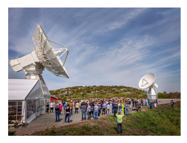
Fig. 1 The inauguration of the Onsala twin telescopes was held on 18 May 2017.

retired colleagues that participated in the first experiment were invited, see Figure 2. Bert Hansson gave a lecture, describing both the extensive preparations as well as the execution of this first experiment.