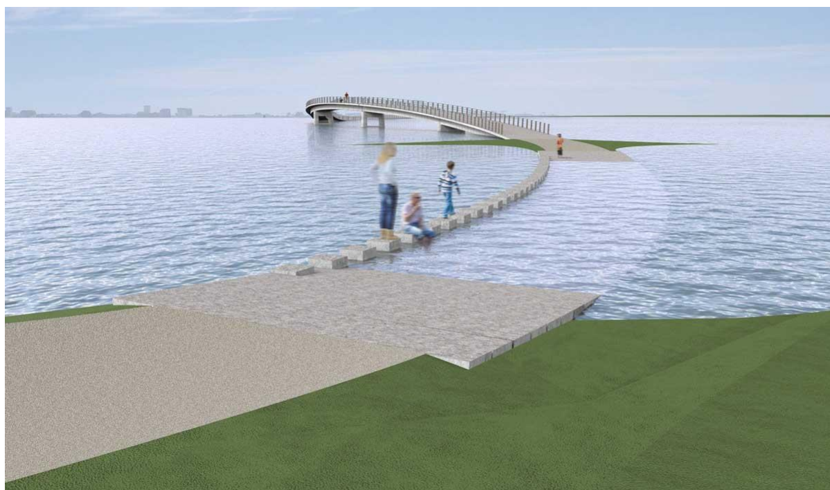
Figure 3. Citadel bridge, Nijmegen - Lent, designed by NEXT architects as part of the climate adaptation project, Room for the River, Netherlands. On high water the bridge floods allowing the visitor to cross using the steps, while the same time spreads awareness on the effects of climate change.

Landscape professionals can help reduce excess carbon emissions, based on knowledgeable and holistic consideration of the environmental issues and not just relying on enhancing the natural sources. It is relevant that plants and trees, the ocean and land can absorb CO 2 (NASA Earth Observatory, 2017), but the goal for practitioners would be to create interventions that not only reduce CO 2 emissions, but also support the natural sinks.