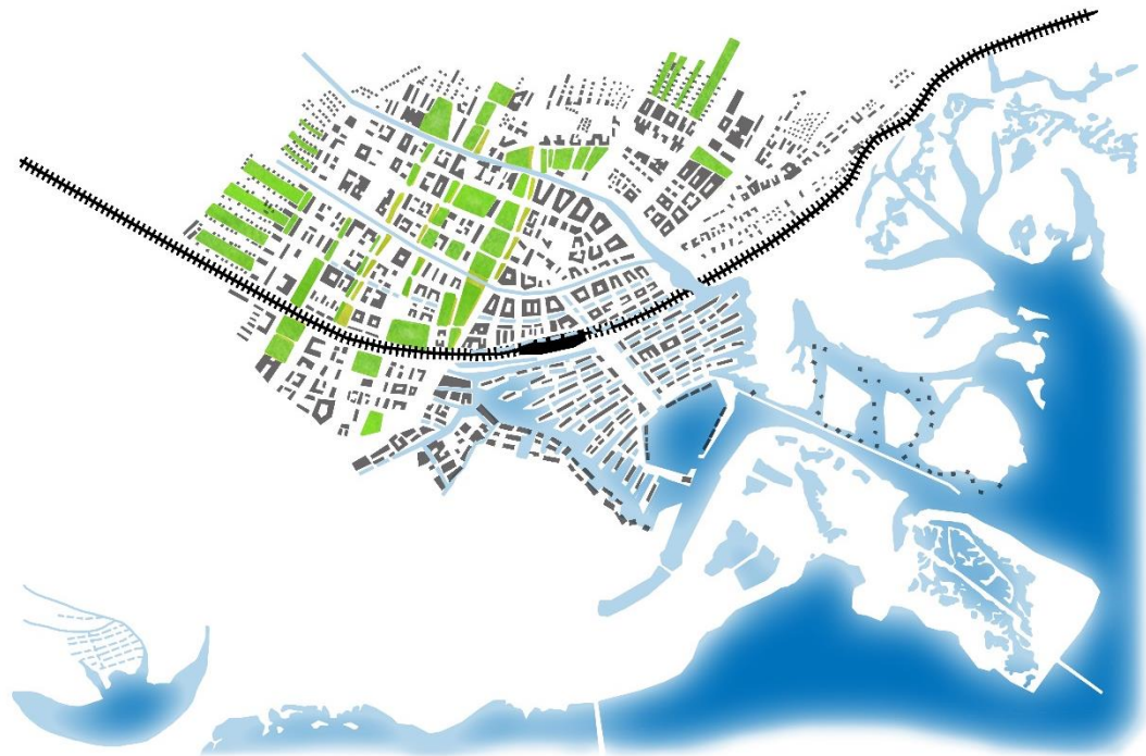
Figure 2. Drawing analysis developed by Nikologianni exploring the potential of a low-carbon landscape and the impact of water and green strategy in the city. The drawing was based on the Stoke Harbour garden city proposal submitted by Shelter & PRP Architects, during the Wolfson Economics Prize 2014.

During the last two decades, sustainable communities and infrastructure have begun to receive attention in the planning literature and therefore 'plans' are now considered either as a 'product of the process or as a guide for promoting a sustainable community' (Conroy and Berke, 2004). It is encouraging that such terms are starting to be linked with strategic schemes and planning, however at the moment low carbon is interpreted in relation to spatial development with a variety of different approaches. Examples such as 'acceptable landscape locations for wind farms' (Cowell, 2010), 'solar energy in landscape' (Pokorný, 2001), 'photovoltaic systems in urban and rural environments' (Redweik et al., 2013), 'ecological landscape' (Makhzoumi and Pungetti, 2003) and the focus on energy, transport and fossil fuels (Harto et al., 2010) show that we are still trapped in the single sided view that the spatial interpretation of 'low carbon' is just about technological projects or the decision on the best possible location for renewable activities.