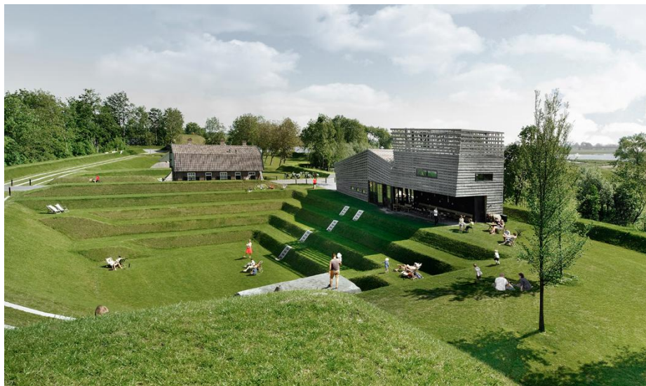
Figure 6: Fort Werk aan't Spoel. Old and new development combines historical and leisure areas.

The national scheme of the New Dutch Waterline aimed to address hydrological efficiency, in a different way to the Room for the River, by preserving and improving the existing land around the fortresses. Spatial quality was also a significant element in this scheme, but it is identified as an idea of preservation, cultural enlightenment, touristic opportunity and celebration of the historic legacy. Therefore, it can be suggested that the interpretation of the low carbon and spatial quality concepts is flexible, aligning with the vision of a strategic scheme. But the engagement of the community, the establishment of a project team that has the support of the legal entities in each country and the integration of key ideas in the project process results to better integration of such concepts in the landscape design, creating sustainable and quality spaces.