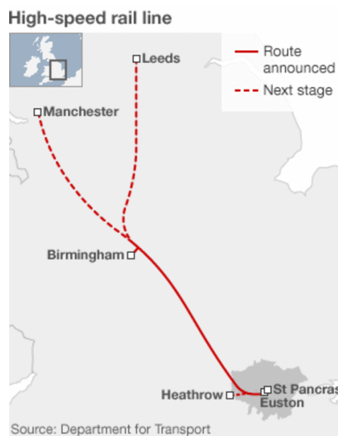
Figure 3: Plan for phase 1 (London–Birmingham) and phase 2 (Birmingham–Manchester & Leeds) of HS2 route.

The case studies have developed individual processes through the various conceptual ideas of the landscape projects, generating a richness of interpretations and methods to make a project successful. The governmental and political commitment to design quality and environmental stability is shown by the economic support, provided to the schemes, creating a political agenda that embeds such key issues in regional design. The paper argues that a new mechanism, focusing on the integration of ideas such as low carbon and sense of place, will have a potential impact on governmental values as well as the transformation of the project's delivery and outcome [9]. Evidence shows that policies and legislation have significant impacts on the implementation of strategic schemes and therefore the ability to develop a range of processes integrating social, environmental and economic elements through landscape design is important.