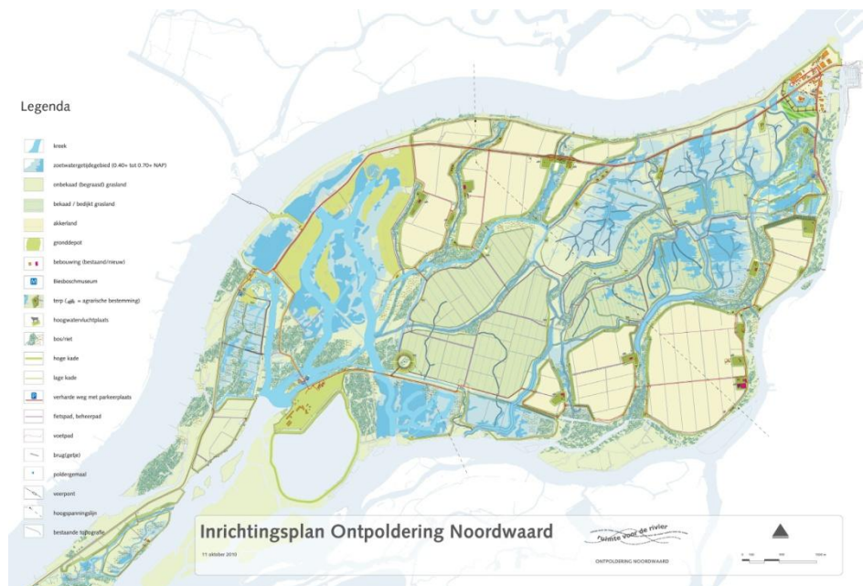
Figure 4: Noordwaard landscape project. The masterplan illustrates the area of development, the water, agricultural areas and mounds where the housing has been established.

revealed that the focus on water safety, agriculture, inhabitants and spatial quality at this location were priorities of the Netherlands secretary of state. The creation of a nature network, recreation opportunities, strong identity for the natural park Biesbosch (Natura 2000), located in the area, and preservation of the historical and cultural structures of Noordwaard such as the Fort Steurgat, have secured the development of a significant project considering both environmental stability and sense of place (Figure 5). Key steps in the successful implementation of the scheme were the governmental support as well as the dissemination of the aims with the public, which supported this ambitious development.