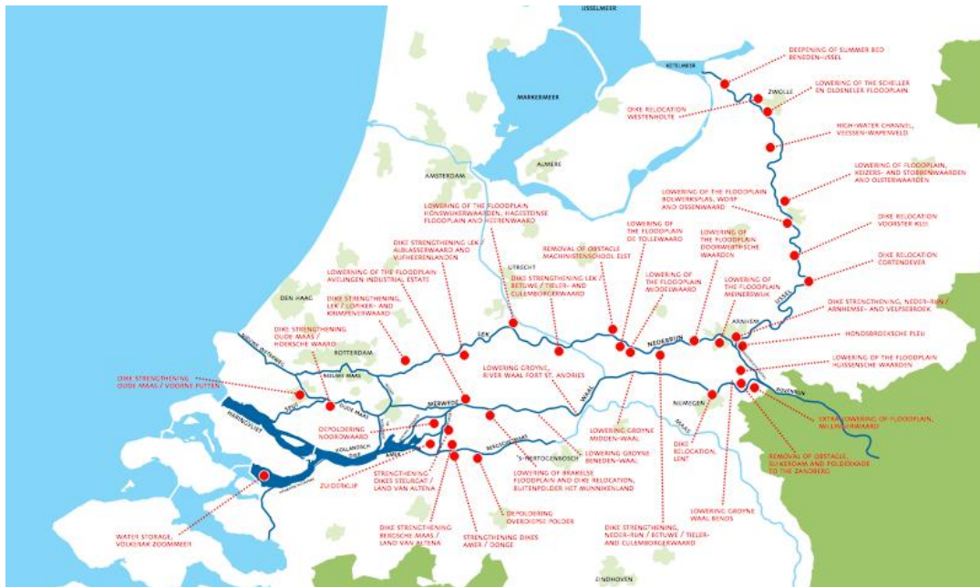
Figure 1: Map presenting all the 34 locations where landscape projects of the 'Room for the River' programme were developed.