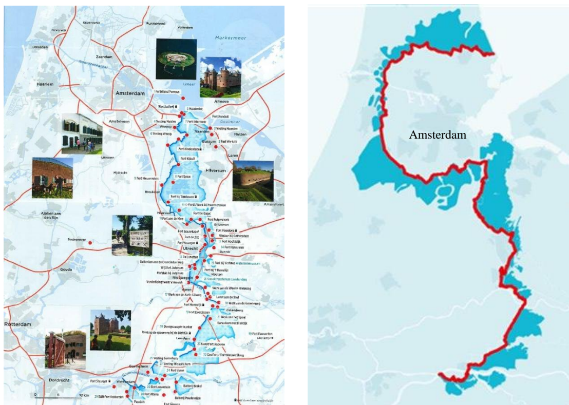
Figure 2: Left: Map of the 'New Dutch Waterline' landscape scheme showing the locations of the fortresses Right: Showing the whole defence line, the locations around the fortresses that are and are now regenerated open areas.