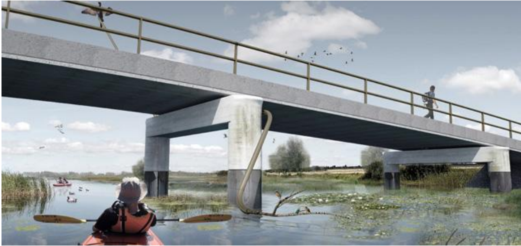
Figure 5: Noordwaard landscape project. The visualisation demonstrates the creation of an environmental friendly and quality space, where activities engage the community enhancing climate awareness.

The national scheme of the New Dutch Waterline aimed to address hydrological efficiency, in a different way to the Room for the River, by preserving and improving the existing land around the fortresses. Spatial quality was also a significant element in this scheme, but it is identified as an idea of preservation, cultural enlightenment, touristic opportunity and celebration of the historic legacy. Therefore, it can be suggested that the interpretation of the low carbon and spatial quality concepts is flexible, aligning with the vision of a strategic scheme. But the engagement of the community, the establishment of a project team that has the support of the legal entities in each country and the integration of key ideas in the project process results to better integration of such concepts in the landscape design, creating sustainable and quality spaces.