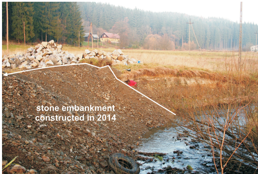
Fig. 4. Ongoing construction of stone embankment in the Krężelka channel in 2014.

Polish Ministry of Environment, the following work was published in 2005: 'Good-practice manual of sustainable maintenance of mountain streams and rivers in southern Poland' [Bojarski et al. 2005]. The study describes adverse natural phenomena related to development of hydraulic structures in river channels along with recommendations for certain actions leading to the preservation of spatial order within valley floors. For instance, there is an option to widen the undeveloped zones along channels instead of erecting anti-erosion constructions and embankments in the channels. Corridors of free channel migration devoid of buildings are then created. Possible flood-protection structures are then located outside of the corridor. It should be considered that massive concrete structures constructed in the channels lead to irreversible and irreparable changes in the character and the condition of rivers [Lenar-Matyas et al. 2010]. The results of regulation works are long term. The ensuing changes in the channel pattern are not final because one regulated section of a channel influences the adjacent channel sections, both downstream and upstream. Bed erosion (incision) of channels is also an indirect effect of regulation. Increased velocity of water flow caused by regulation disturbs the balance between a river's ability to transport debris and the sediment load in reality transported by a channel, which leads to an abrupt deepening of the channel [Wyżga 1991, 2008].