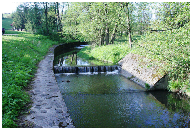
Fig. 3. Concrete embankment and concrete check dam in the Czadeczka channel.

Local inhabitants bring pressure to bear on the local authorities to regulate both rivers. First, channel banks are reinforced with stone blocks or concrete to prevent lateral erosion and then channelised. Next, after the channel is straightened, heavy bed erosion occurs. Thus, the channel bed is concreted over and check dams are constructed against the incision.