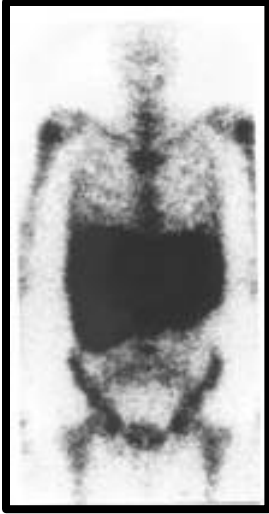
Figure 3: Anterior whole body scintigraphic image following injection of ^{123}\text{I} -human serum amyloid P in a patient with AL amyloidosis. Uptake is seen in the bones, liver and spleen.