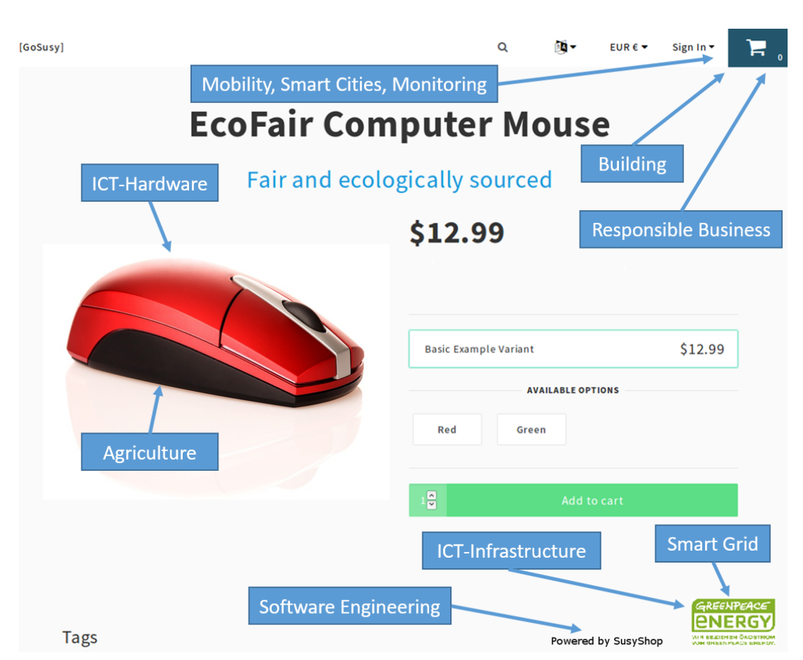
Figure 3: GoSusy online-shop example screen shot.

Responsible Business: Research concerned with the question how a business in general could behave more responsible [21] could lay a foundation to GoSusy's business practices (in the figure represented by the shopping cart).