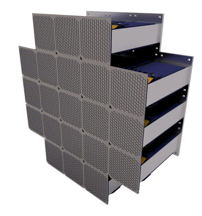
Figure 2. Drawing of the TRISTAN detector design: 3486 pixels on a 400 cm<sup>2</sup> plane divided into 21 identical modules.