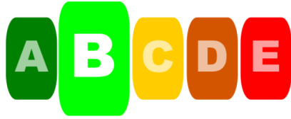
Fig. 2. Selected colour scheme as robustness indicator based on the French Nutri-score scheme (Julia et al. , 2018).