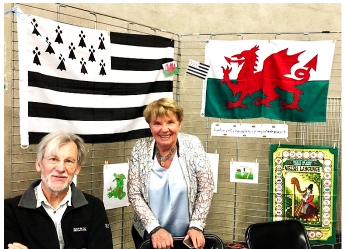
Fête des Associations Hennebont 2019

Town twinning – ‘jumelage’ in French – largely began after WWII to help rebuild good relations among national neighbours. Now, twinning is common across Europe, from cities to villages. Twinning is more than an official agreement or commemorative sign. Twinning associations allow residents to get involved. Events and activities include: socialising, school exchanges, sports, music and dance, holidays and tours, language learning, and formal delegations.