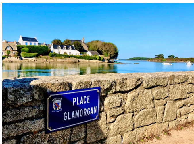
St-Cado's Island, near Hennebont

Hennebont is around 15km from Lorient, one of the largest fishing ports in France and famed for the annual Festival Interceltique. The region has historic Welsh connections. The 6 th century Welsh saint Cado, or Cadog, crossed the channel and is believed to have lived on an island in the Etel river, where a chapel commemorates him. More recently, Breton timber was traded for Welsh coal, which was brought up river to fuel Hennebont's industry.