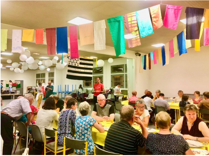
Dance exchange dinner, St-Brieuc