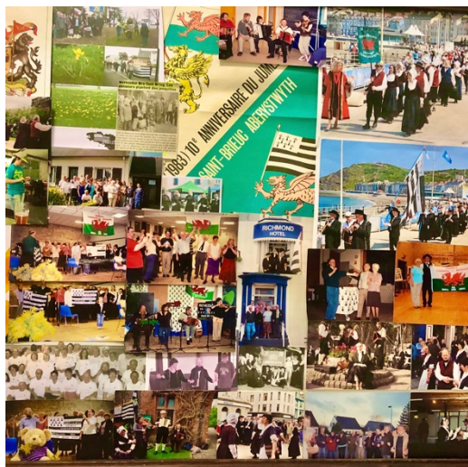
St-Brieuc – Aberystwyth twinning memories

Bryonny saw some spots where town twinning is commemorated in St-Brieuc – including the Aberystwyth roundabout! She visited the harbour and viewed the bay, learning about past stories and present challenges.