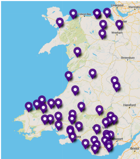
Twin towns in Wales

Many Welsh towns are twinned with towns in Brittany. Twinning is part of civil society, providing opportunities for international friendship and cultural exchange. Welsh-Breton connections especially celebrate shared Celtic heritage. But, with challenges from budget holidays to Brexit, will town twinning stay relevant, or be relegated to the past?