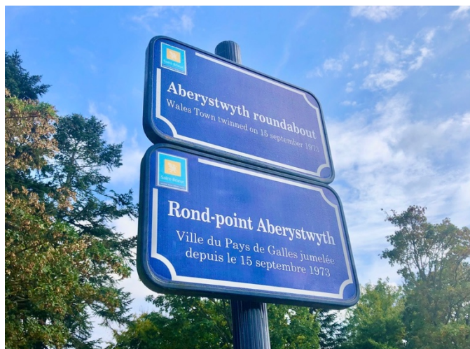
St-Brieuc's 'Aberystwyth Roundabout'

St-Brieuc is named for a Welsh saint – St Brioc, or Briog. He travelled from Ceredigion in the 5th century, and is known as one of the seven founding saints of Brittany. The town today is best known for its distinctive scallops – the coquilles St-Jacques.