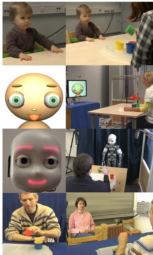
Figure 5. Experiments to gather interaction data. Participants (parents, adults) were asked to demonstrate actions such as stacking cups to a child (top level panels), a virtual robot on a screen (2nd level panels), the iCub robot (3rd level panels) or another adult (bottom panels). See section 4.2

The reports in this section focus on analysing social interactions, particularly between a teacher and a learner. The results from these experiments feed into work on robotic language learning, as described in sections 2 and 3, where iCub learns from a human teacher (on the other hand, a human may learn an action from a robotic demonstrator). The first subsection describes research into communication, possibly not intentional, through gaze,