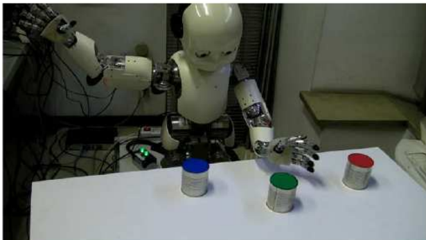
Figure 2. The set up of iCub for experiments is described in Section 2.1. The robot was trained via a trial-and-error process to respond to sentences such as "reach the green object". It then becomes able to generalize new, previously unheard sentences with new behaviours.

The MTRNN and RNN methods above were applied in experiments with the iCub robot to investigate whether the robot could develop comprehension skills analogous to those developed by children during the very early phase of their language development. More specifically, we trained the robot using a trial and error process to concurrently develop and display a set of behavioural skills, as well as an ability to associate phrases such as "reach the green object" or "move the blue object" to the corresponding actions (see Figure 2). A caretaker provided positive or negative feedback about whether the robot achieved the intended results.