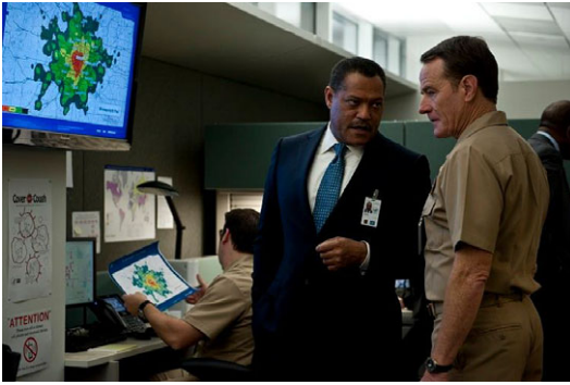
Figure 1 Screen-capture of city map of disease spread, from Contagion

gather around them, for they are depicted in the film as being all too aware of intimate sites of passage: the restaurant serving infected meat, the hotel room where one adulterer meets another, the laboratory whose workers methodically search for a vaccine, the make-shift quarantine where the state sends people to die. 14 Such sites, Deleuze and Guattari might offer in this context, are the ‘space[s] of contact, of small tactile or manual actions of contact, rather than a visual space’ (1987, 371). Topologically speaking, the spaces depicted in Contagion are at once singular and mobile – this is an immanent geography of dynamic sites (Woodward et al. 2010 2012) and their tactile surfaces. They emerge in the cuts that weave together the narrative threads, as illustrated above, but also in a dialogue that repeatedly calls out newly infected spaces, and, importantly for us in light of the preceding discussion of the ‘feeling’ of sight (as opposed to an ocularcentrism), by way of the lingering touch of the camera on infected objects.