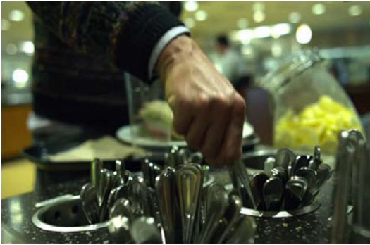
Figure 3 Screen-capture of eating utensils as fomites, from Contagion