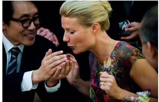
Figure 5 Screen-capture of human host, from Contagion