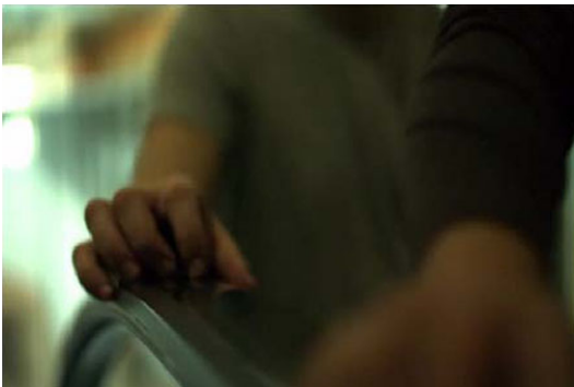
Figure 4 Screen-capture of an escalator hold, from Contagion