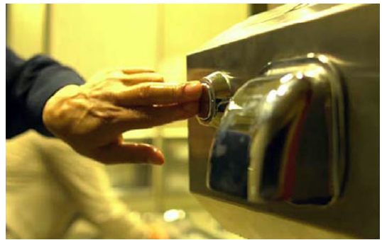
Figure 6 Screen-capture of a bathroom hand dryer, from Contagion

presences are constantly mobilised into yet another epicentre. Both slick and textured surfaces are crucial points of passage, as the virus spreads from mouth to hand to object and back again (Figure 4), but so too are the propellant bursts of air, filled with droplets, that emerge from human hosts (Figure 5) and appliances (Figure 6).