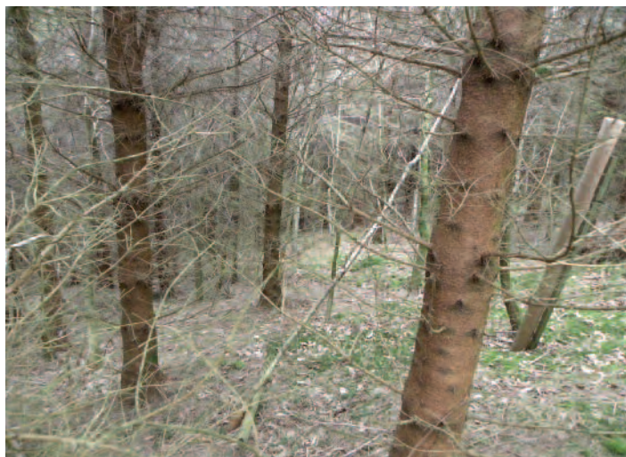
Figure 1. Illustration of conditions in blocks 1 and 2 during surveys in 2014, with sessile oaks ( Quercus petraea ) heavily shaded by the 9-10m tall Norway spruce ( Picea abies ) trees (both planted at 2m square spacing).