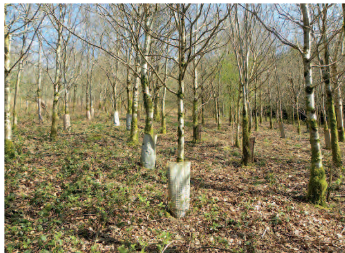
Figure 2. Illustration of conditions in the open block 3 during surveys in 2014, with sessile oaks ( Quercus petraea ) planted at 2m square spacing.