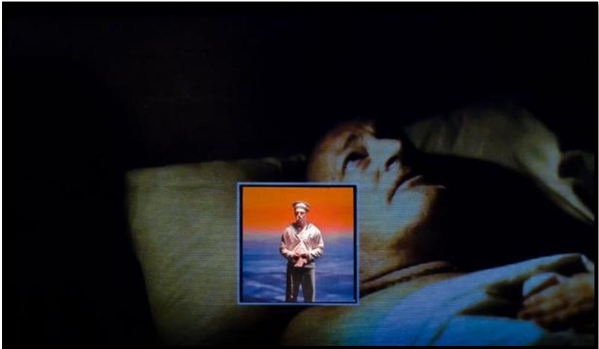
Figure 1: 'Prologue' from 6 Degrees Below the Horizon . Photo: Ed Warring

This theatrical deconstruction of cinematic aesthetics offered possibilities of reading the piece and its connotations as a more 'open text'. Umberto Eco's concept of the 'open text' has a certain affinity with the (syn)aesthetic mode of spectatorship. The 'open text' refers specifically to an ambiguity of narrative as enunciated by a linguistic code, a possibility of making a plurality of meanings during the act of reading and also the possibility of placing in 'doubt the very structure of the code itself' (Eco 1979: 67). Like the suspended reader of the 'open text' a (syn)aesthetic mode of spectatorial engagement can turn narrative expectations into something uncommon or instinctive, hence eliciting an openness towards the exploration of 'unconventional' readings of a text. The difference is that Eco's readers engage with the open text mainly on a semiotic basis, whilst Machon's (syn)aesthetics emphasise a visceral, sensorial engagement as a basis for the meaning making process, one that in this context engenders an openness of interpretation. As I will argue later in more detail by analysis the function of the soundtrack within the piece, (syn)aesthetic perception allows for a re-evaluation and (re)cognition of the relationship between the somatic, sensorial and the semantic, semiotic content of an artwork.