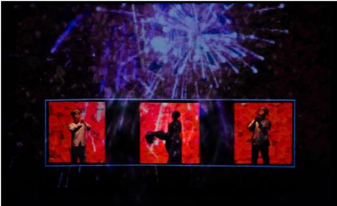
Figure 3: 'Lovemaking Scene' from 6 Degrees Below the Horizon .

An example of this in Tales from the Bar of Lost Souls is the 'Love making' scene, which comes after the protagonist meets his future wife, a local singer in one of the taverns; after a bar fight with local sailors he is injured and she decides to take him in for the night and attend to his wounds. They fall for each other and end up in bed. In this scene the live performance is structured through three vignettes: the central one showing the two lovers and two side frames showing sailors praying.