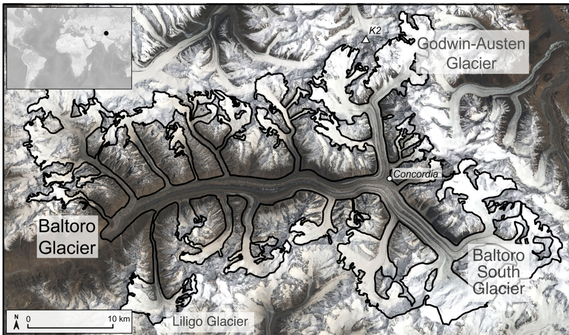
Figure 1. The regional extent of the Baltoro Glacier system and relevant locations, including Concordia and named tributary glaciers.

each other to confirm that there was no pixel shift present between images. Orthorectification was then undertaken on each ASTER image using the ENVI (v.50) ASTER orthorectification tool, which corrects the effects of sensor tilt and terrain, and creates a planimetric image.