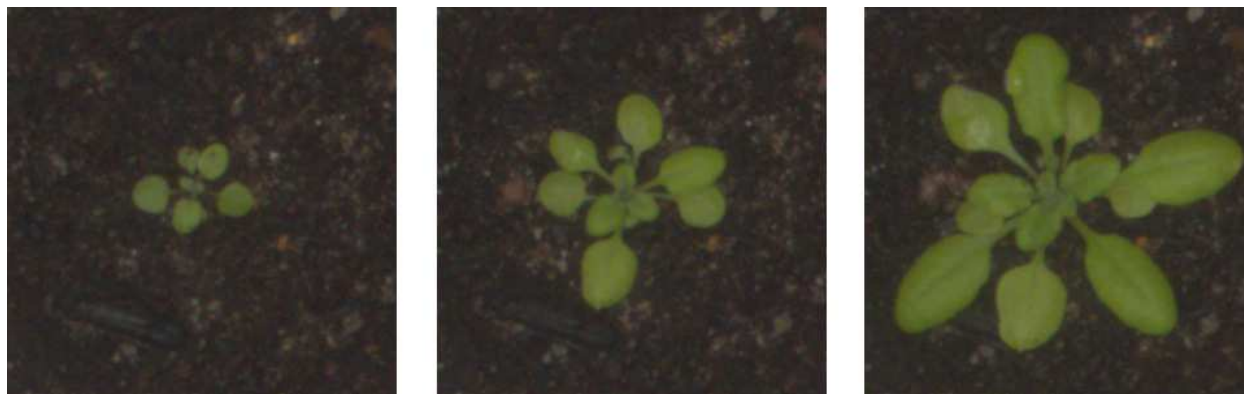
Fig. 2. Three views of the same Arabidopsis plant taken six days after the previous image, showing how leaf occlusion increases with age.

As outlined in the introduction, the most basic measurement of interest to biologists is the leaf area of the plant. This is shown to have a close correlation with the overall size of the plant expressed in terms of its fresh or dry weight [4] though the occlusion of leaves causes this relation to change as the plant grows. A plant's capacity for photosynthesis (and so "primary production" of