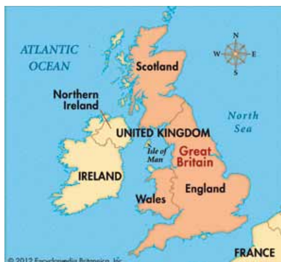
Fig. 1 Map of the British Isles showing national divisions.

The UK has a coastline in excess of 31,400 km and has macroalgae growing off-shore for the majority of its length (Fig 1). An estimated 10 million tonnes of seaweed surrounds the Scottish shores alone. Seaweed grows rapidly and is capable of yielding more kg of dry biomass m -2 year -1 than fast growing terrestrial crops such as sugarcane, due to its ability to take up nutrients over its entire surface and a lack of lignin-like energy-intensive supporting tissue which is necessary for land plants. Seaweed also has a number of significant benefits over terrestrial crops including not being a food, not requiring land or fresh water and having rapid growth. Despite this, seaweed is not currently used to its full potential in the UK with factors for this including the availability of cheap imports and a lack of mechanical harvesting processes. Historically, though, seaweed has been used much more extensively for a number of purposes.