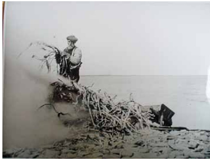
Fig. 2 Burning kelp on Holm, Orkney Islands.

In 1720 the price of soda ash was £2 t -1 (approximately £270 or ¥42K in today's money). As the century progressed, this industry became more established and prices were raised as demand increased. Towards the end of the century the French revolutionary and Napoleonic wars in mainland Europe affected trade with other countries, preventing the other main soda source, Spanish Barilla soda, from being imported. This soda was extracted from a range of saltwort plants, including Salsola soda , and could have a purity of up to 30% soda. This buoyed the British soda industry, which in 1800 produced 20,000 t ash which retailed at up to £22 t -1 (£1600 or ¥250K t -1 in today's prices). As the wars began to cease, Barilla soda was again available, and at £10 t -1 and a greater purity than kelp soda, led to a demand slump and related price crash. In 1820, the price per tonne of soda was £2, as it was in 1720, but with a current value of approximately £140 or ¥22K. This rapid loss of relative prosperity to the landowners and crofters in Scotland contributed to the Highland clearances, a mass migration process which occurred between 1750 and 1880. This was instigated by the landowners, who collectively drove more than half of the Scottish people from their homes within this period to allow the land to be used for more profitable livestock grazing instead.