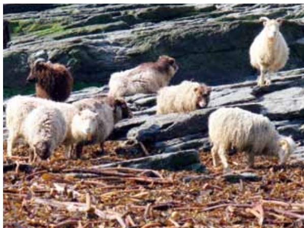
Fig. 3 Sheep feeding on seaweed on North Ronaldsay.

A range of seaweeds have been used historically and are still used in animal feed. This can be through allowing grazing animals to have access to a beach with fresh or cast seaweeds (Fig. 3); or through provision in their feed. Supplying elements, vitamins and nutrients including protein, the seaweeds used include Laminaria , Macrocystis and Ascophyllum species. The seaweeds are typically dried and milled before mixing or adding as a supplement of \leq 10\% . Seaweed supplements have been shown to benefit a wide range of animals including pigs, cattle, horses, sheep, fish and domestic pets.