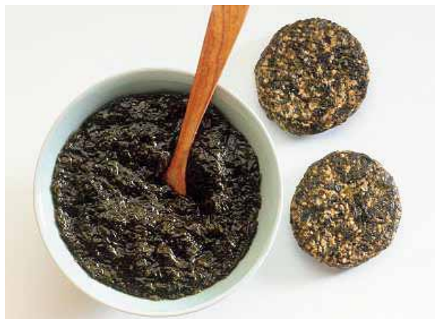
Fig. 4 Left: cooked laver, Right laver bread.

One region of the UK where seaweed is eaten regularly is south Wales. In addition to a number of cottage industries, where Porphyra umbilicalis is wild-harvested and prepared for the household or a local farmer's market, there are two main companies which sustainably harvest from the west coast of the UK under licence. In both cottage industry and industrial processes, the Porphyra is washed and cooked for several hours to become a dense, spinach-like product called laver. Traditionally this is mixed with milled oats and made into round discs (Fig. 4). These are then fried and eaten with pickled cockles (small bivalves preserved in vinegar) and bacon for breakfast. It has been suggested that this diet was encouraged during the industrial revolution to address nutritional deficiencies in the diets of local coal miners and their families.