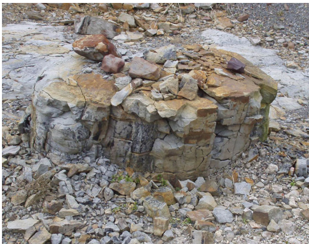
Fig. 4 An arborescent lycophyte stem projecting above the shale. Weathering has now destroyed it

After the dismantling of the steelworks, opencast mining of coal on the site worked the upper part of the Middle Coal Measures (Bettisfield) Formation of Duckmantian (Westphalian B) age, within which the most productive seams in the coalfield are found (Fig. 2). A small area of exposed Carboniferous rocks near the heritage area was not opencasted when an important assemblage of plant fossils was discovered. This is the Fossil Forest to be discussed here.