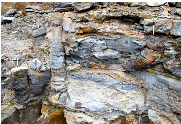
Fig. 9 A group of calamite pith casts of stems (arrowed) extending through and to the top of the sandstone unit. The most complete of the stem pith casts shows a branch pith cast coming off to the right and curving upwards

ironstone-preserved plant fossils, it is without doubt unique of both national and international importance being a SSSI and a new GCR site. This is an example of how the GCR is being kept up to date as new information becomes available. For further information on the British GCR and international palaeobotanical sites, see Cleal and Thomas (1995) and Thomas and Cleal (2005, 2012). Additional information on the local geology can be found in Calver and Smith (1974), Davies et al. (2011) and Webb et al. (1928).