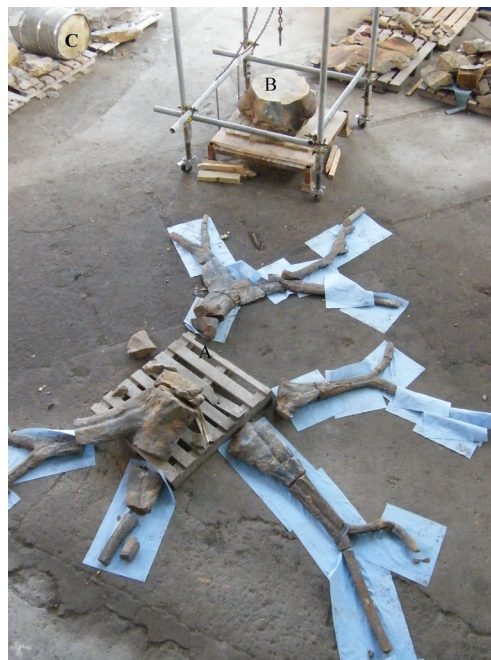
Fig. 8 The Stigmaria laid out before its restoration (A) with two of the four sections of stem (B, C)

The following thin mudstone contains many Calamites , lycophyte stems and cones with some exposed surfaces strewn with dispersed megaspores, and in the next sandstone layer, large numbers of Calamites stems occur as pith casts in their original erect positions of growth (Fig. 9) (Thomas 2014). It is the erect, in situ, stems of Calamites that make the site so significant; but with the presence of in situ lycophyte stems, the complete Stigmaria and the wealth of compression and