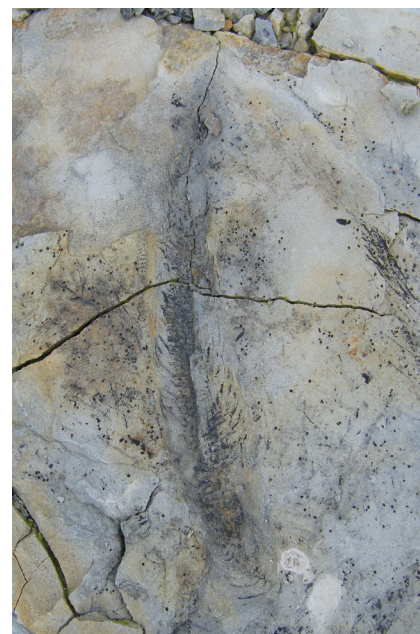
Fig. 5 A lycophyte leafy shoot ( Lepidodendron ) bearing a terminal cone ( Flemingites ). The numerous dispersed megaspores (referable to Lagenicula horrida ) scattered near to the cone are identical to those obtained from the cone. The megaspores are approximately 1 mm in size

The Fossil Forest site is approximately 1000 m 2 in size with about 14 m of Coal Measures of middle Duckmantian age exposed (Fig. 3). Two coal seams are included in the sequence with the lower, 0.8-m thick, Crank Coal being underlain by a palaeosol containing the basal portions of arborescent lycophyte stems. It is overlain by laminated mudstones with fragments of pteridosperms, such as Neuropteris , Karinopteris and Aulacotheca , ferns, such as Sydneia , Euspenopteris and Palmatopteris , together with Calamites and lycophytes (Fig. 4). In its lower part, there is a thin band of ironstone nodules that