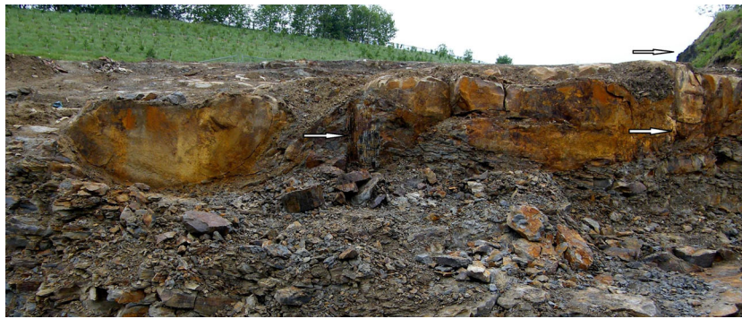
Fig. 3 The sediments of the sequence at Brymbo showing the mudstones above the Crank Coal followed by massive sandstone containing casts of two arborescent lycophyte stems ( arrowed ). The one on the left has been

removed leaving only a cast. There are fine shales above the sandstone leading to the upper coal seam (2-yd seam) which is also arrowed