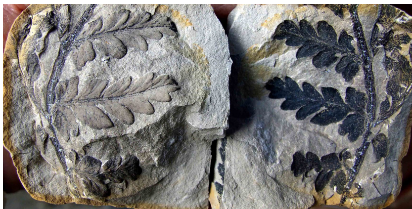
Fig. 6 A split ironstone nodule containing the part and counterpart of the pteridosperm Karinopteris jacquotii

have yielded plant remains of pteridosperms, ferns, Calamites and lycophytes (Fig. 5) with many of them being fertile (Appleton et al. 2011, Thomas and Seyfullah 2015a).