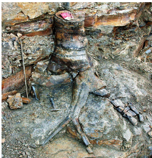
Fig. 7 The dichotomising Stigmaria rooting structure of an arborescent lycophyte together with the basal portion of the main stem

Stigmaria is one of the iconic plant fossils of the Carboniferous, and fragments of the narrower parts of the rhizomorph are found in most museum collections.