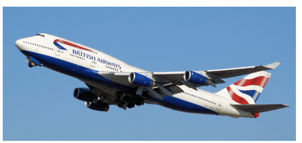
More cargo: supply shortages in other countries made British exports more appealing to overseas markets

which will almost certainly rise in price in the future as energy and raw material prices increase," Simon explains. "Although organic farms generally produce fewer products per hectare, their energy input is likely to be less per tonne because they don't use artificial fertilisers, which are very energy-intensive to produce. As oil reserves dwindle, it could become less economic for farmers to use artificial fertilisers and they may well have to return to organic techniques."