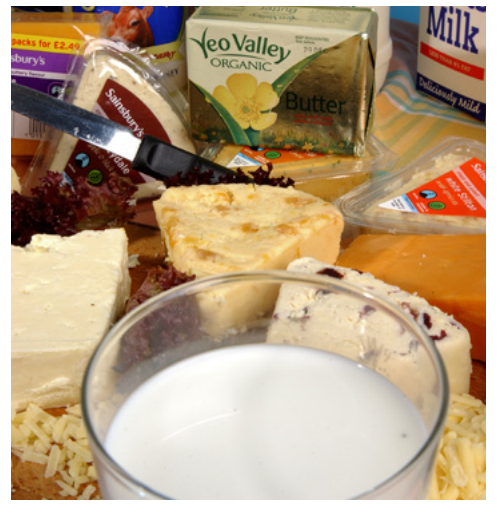
Conventional dairy profits grew in 2008/9

"During the start of the recession, the media reported that consumers had been buying less organic food because it is too expensive and this hearsay can affect the decisions farmers make," explains Simon Moakes, an organic and