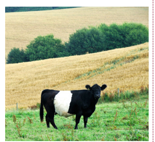
Belted Galloway beef cow grazing on a hillside

"Overall I think organic farms are potentially more financially sustainable in the long term. They don't rely as much on external inputs such as fertiliser and crop protection products,