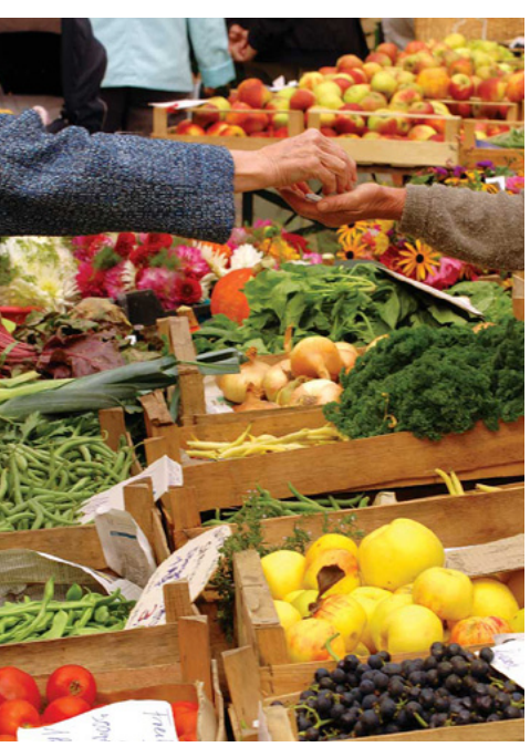
A customer hands over money at a farmers' market

"The overall profitability in general for organic farms in 2008/9 was largely the same as in previous years," says Nic. "It seems that the credit crunch didn't have that much of an impact. Organic farming had a relatively stable income, which is reassuring for farmers."