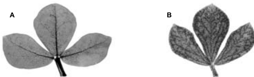
Fig. 1. Leaves of L. corniculatus lines stained for the presence of condensed tannins with DMACA: (A) untransformed control line, (B) Sn transgenic line Sn 11.

Sn is a member of the R family of myc regulatory genes from maize ( Zea mays ), where it regulates the cell specific deposition of anthocyanins in seedlings and adult cells (Tonelli et al. , 1991). Transgenic lines of L. corniculatus var. Leo isogenic genotype S50 transformed with the constitutively expressed Sn bol3 allele are altered in their accumulation of CT accumulation in root and foliar tissues (Damiani et al. , 1999). In many lines there is a marked increase in CT accumulation relative to control plants. This can be seen clearly in Fig. 1, which shows leaves from an up-regulated transgenic line and a control line in which the CT containing cells have been stained purple with DMACA (Li et al. , 1996). This effect of the transgene is specific to CT and anthocyanin biosynthesis and analysis of other key flavonoid end-products in leaf and stem samples shows no alteration in the levels of lignin and flavones (Fig. 2).