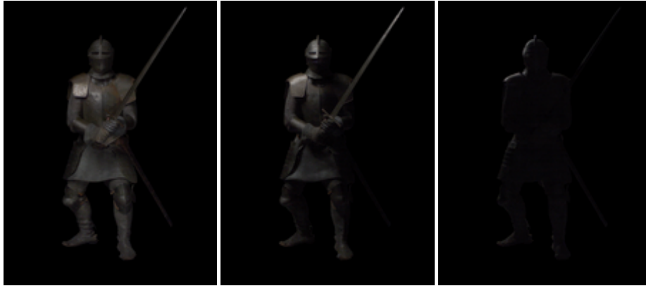
(d) Knight (PDE: \alpha = 1, u = 0.5, v = 1.63 ) (e) Knight (PDE: \alpha = 1, u = 0.5, v = 3.26 ) (f) Knight (PDE: \alpha = 1, u = 0.5, v = 5.96 )