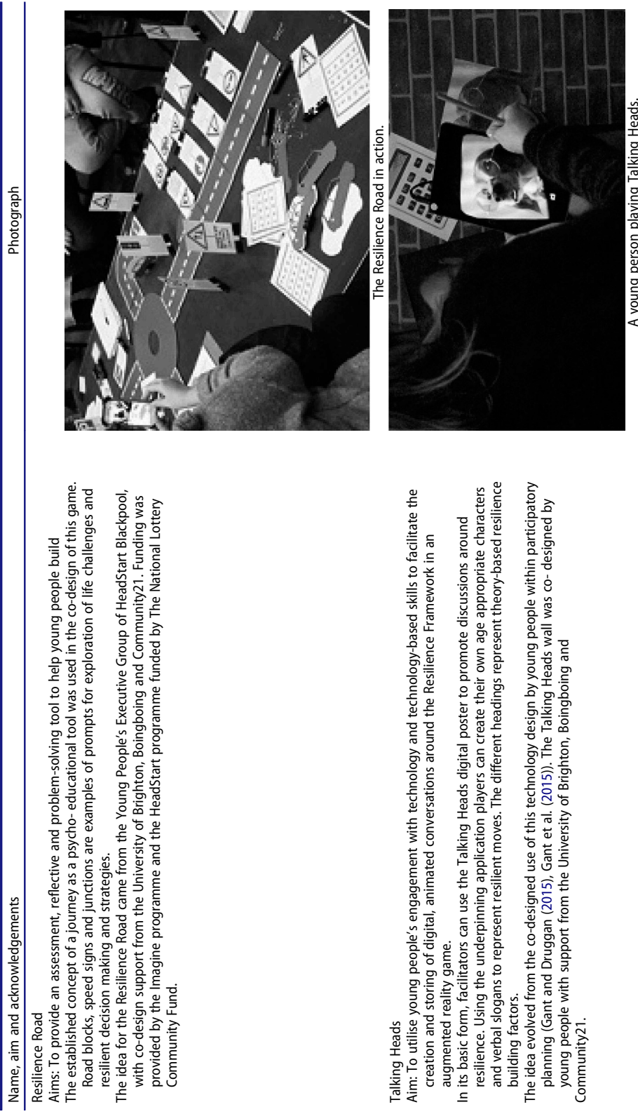
Table 1. (Continued).