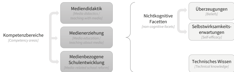
Fig. 3.: M 3 K Structural competency model of Medienpädagogische Kompetenz (Diagram adapted from Herzig et al., 2016, p. 11).

To summarize the findings regarding the overall model structure, DigCompEdu has been allocated to the group of competency development models; TPACK clearly is a structural competency model; and M 3 K has been interpreted to belong to this category as well even though it represents a more complex level-oriented approach in comparison to TPACK regarding the standards included. Yet it has been defined as a structural competency model because of the focus on the relationship between the competency fields and areas and because there are no competency levels quantifying the proficiency or degree of competency of a person. However, there are hierarchical structures within the M 3 K competency aspects and in the standard descriptions based on Bloom's taxonomy, which is a common feature for competency level models. Hence, M 3 K unites characteristics of both approaches. To conclude, this structural analysis of the three models confirms that the distinction between structural competency models and competency level or development models is not fully selective.