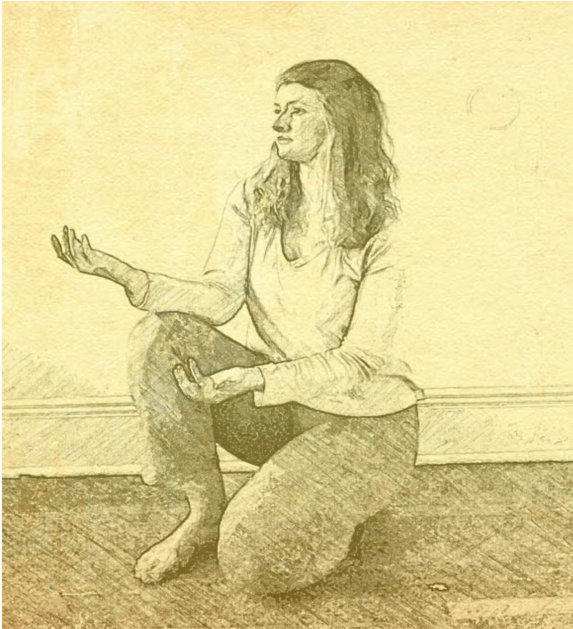
Figure 1. Embodied personal reflection of the warm-up. Awareness and Openness