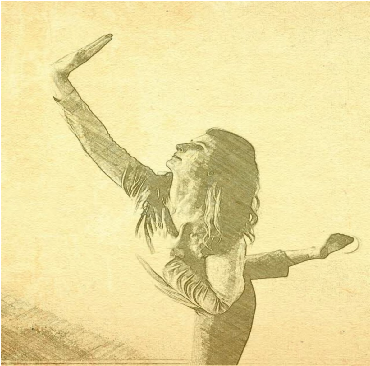
Figure 2. Embodied personal reflection of the theme development. Reach and Connect