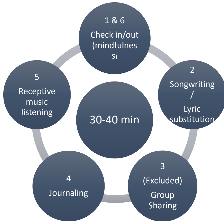
Figure 3: Self-Exploration Adapted Intervention Protocol

Step 1 & 6 –Check in/out (Mindfulness). The check-in and check-out process was adapted to consist of brief mindfulness processes, with the goal of gaining insight about immediate needs, related to the support level scale used during the on-site protocol. No specific question or intention was set up within the protocol, allowing these to arise naturally at the start and the end of each session.