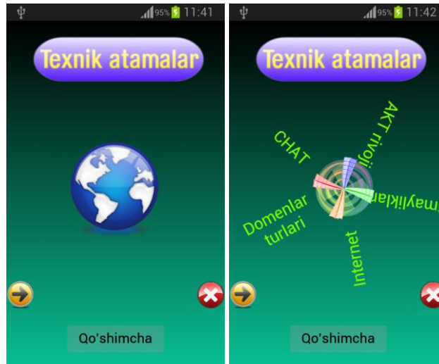
Fig.1. Main form of "Encyclopedia" application

The program compiled for the Windows operating system and Android platforms. The program is based on the C++ programming language. The main purpose of the program create dictionary of technical terms in the field of information and communication. The program is based on more than 14000 technical terms. You can see through them to select or search for the name. More convenient to search for the "Characters" panel, where you can chose different terms. You can copy the meaning of the term "memo" components tab. The program design is user friendly. Easy to read the meaning of the term, and search term placement.