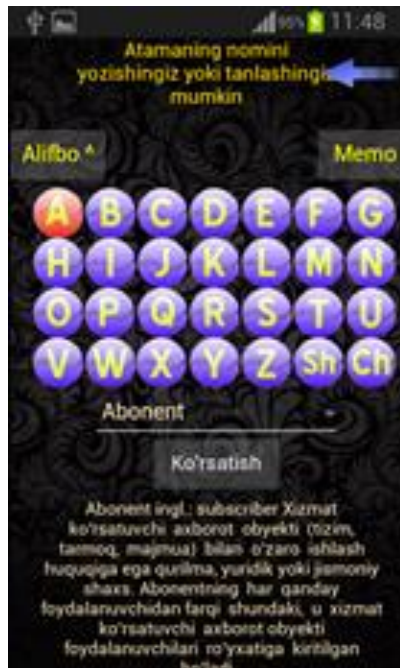
Fig.3. Finding with "Characters"