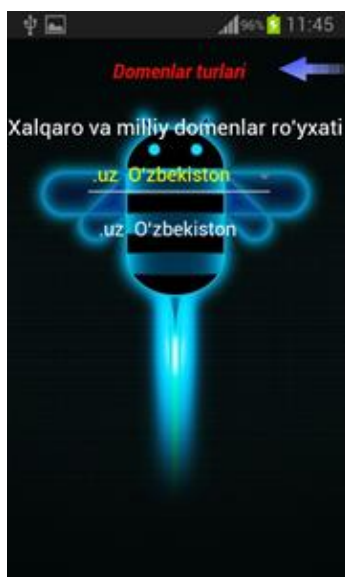
Fig.5. Form of "Domains"

In "Domains" menu all types of information about the national popular domains and domains. There are total number of domains in more than 260.