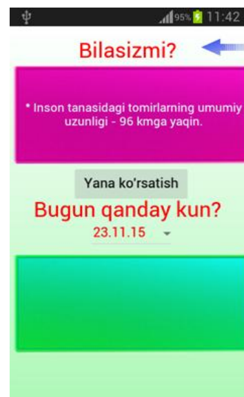
Fig.6. Form of "Additional"