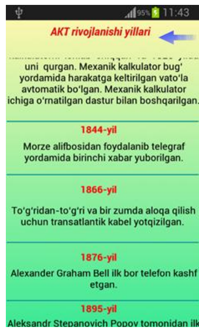
Fig.4. Form of ICT developing years

In "Domains" menu all types of information about the national popular domains and domains. There are total number of domains in more than 260.