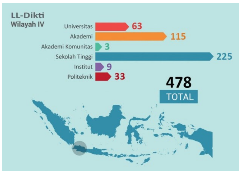
Figure 1. Infographics of higher education under the guidance of LL-Dikti IV

and 110 in Banten [1]. The distribution of higher education under the guidance of LL-Dikti IV based on its form can be seen in infographics in the following figure 1.