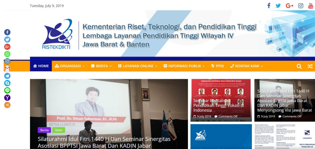
Figure 2. Landing page of LL-Dikti IV website

The Website has become the official website of the LL-Dikti IV. As already known that the website is one of the many media dipergunakan by various organizations as a funnel of information to the public. Even the websites are also referred to as the window of a organization. Therefore, to see the activities of an organization, it can be done just by searching the official website.