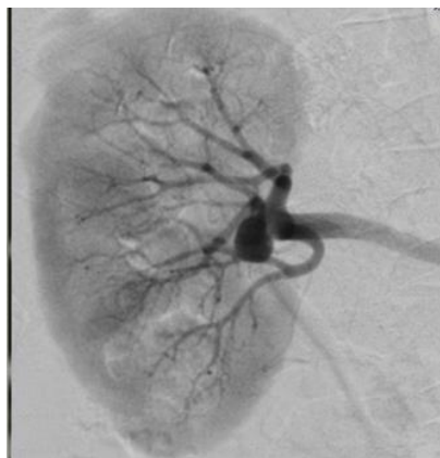
Figure 1. Renal artery aneurysm

Under standart sterile conditions, we punctured femoral artery with 18G needle, we placed 6F 45cm vascular sheath (Medtronic, Minneapolis, Mexico) with the aid of guide wire. We have catheterized right renal artery selectively with 5F cobra catheter (Terumo Europe, Leuven, Belgium) following on the taking angiographic images, micro catheter was placed as coaxial into the aneurysm sac. We