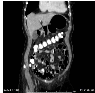
Figure 2. In the follow up CT scan, regression of the intramural thickening and dilatation of the small intestines was observed.