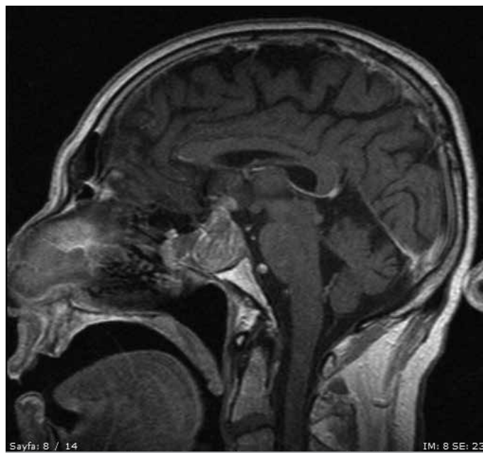
Figure 2. Mass lesion having sellar-suprasellar localization, generating pressure on the optic chiasm, a thickening infundibulum, and having extension into the sphenoid sinus in pituitary MR. MR: Magnetic resonance