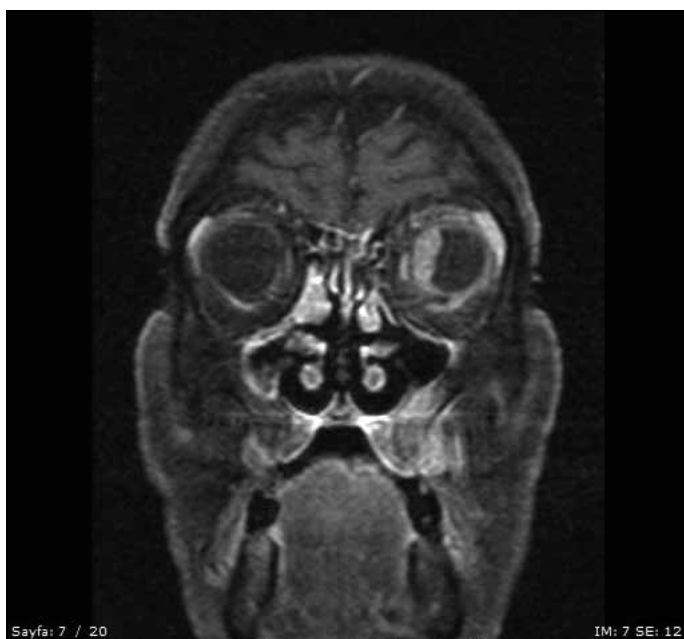
Figure 1. Mass lesion having contrast involvement not extending out of the globus in the medial and left globus in orbital MR. MR: Magnetic resonance

insipidus or oculomotor nerve palsies can be seen (4). In our case, a 69-year-old male patient presented with intermittent gross hematuria and irritative micturation. There was no medical feature in his medical history. Urothelial carcinoma was detected in the bladder. Mass lesion was observed in the right lung in chest radiography. Orbital magnetic resonance (MR) imaging was performed because of redness in the left eye in fundus examination. In orbital MR, the mass lesion was observed to not extend out of the globus at the medial in the left globus, which had a hypointense feature in T2-weighted series and a mild hyperintense feature in T1-weighted series, with contrast involvement restricted in diffusion in diffusion-weighted examination and with a diameter of approximately 12×8×17 mm at its widest (Figure 1). Pituitary and brain MR were conducted on observing the mass in cella in the sections examined. In the pituitary MR, a mass lesion with an approximate diameter of 27×33 mm at its widest was observed, which had sellar-suprasellar localization, generated pressure on the optic chiasm, had thickened infundibulum, and had extension into the sphenoid sinus. The mass leaned to the cavernous portion of the bilateral internal carotid