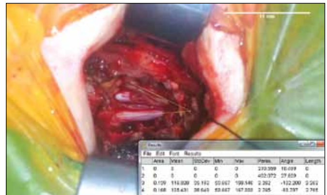
Figure 2: Roots angle and thickness measurements with ImageJ program from the operation records.

Nerve root thickness was measured using the ImageJ program. Accordingly, the mean nerve root thickness was 1.92\text{ mm}\pm 0.45\text{ mm} for medially located roots and 3.33\text{ mm}\pm 0.95\text{ mm}