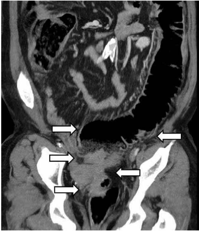
Figure 1. Reconstructed coronal computed tomography image showing diffuse, irregular rectal wall thickening and dilated proximal colon segments (arrows).