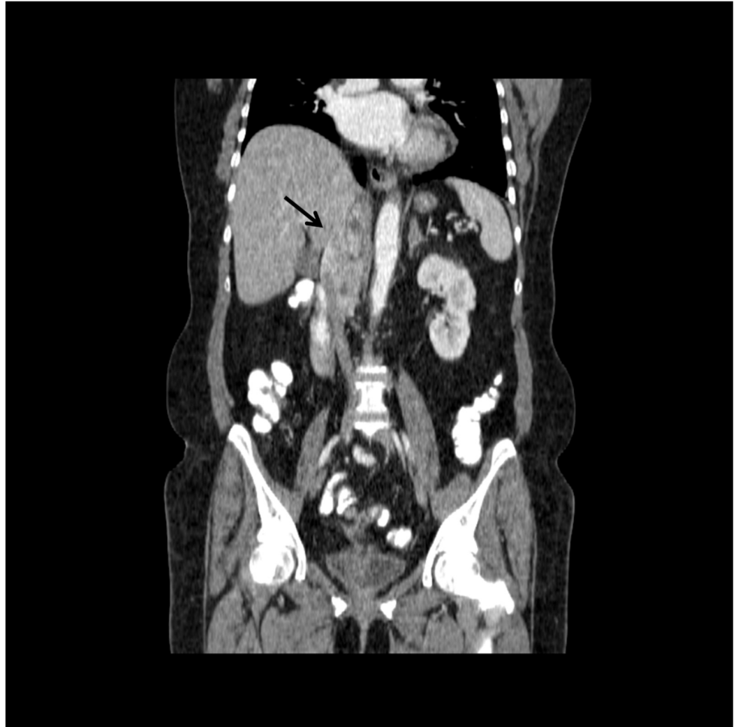
FIGURE 2: Right-sided 75 x 37 mm irregular and heterogeneous mass lesion extending inferiorly from the diaphragmatic crus level, invasive to vena cava inferior and right lobe of the liver (black arrow)

The lesion showed heterogeneous enhancement with occasional cystic necrotic areas and a calcified focus. It was observed that the mass was invasive to the vena cava inferior and showed nodular invasion approximately 1 cm in diameter in the subcapsular area in the inferior segment 6 level of the right lobe of the liver. The appearances that suggest the tumor thrombus is remarkable in the vena cava inferior. Metastasis was not detected in the patient's thorax computerized tomography scan.