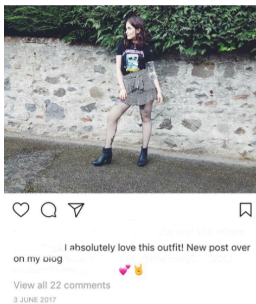
Figure 6: Happy and sassy

In the interview, Hirta drew on two of her sample posts (Figures 6 and 7) as examples of how her sense of self was impacted by place and how this was acted out online through Instagram.