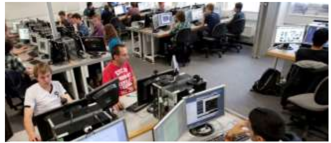
Figure 3: UoP cyber-range

It is important to recognise that, although researching maritime cybersecurity is crucial, it is not currently an easy area of research. As maritime cyber data is scarce, commercially sensitive, or