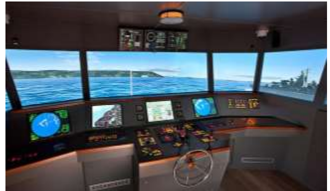
Figure 4: UoP ship simulator, main bridge

pertains to national security, and the equipment necessary to represent shipping environments is much more expensive than more traditional security labs, it may be overlooked as a research field. Providing a space where government industry and academia can pool resources and research efforts will be of significant benefit to all those involved with maritime. While this maritime-cyber lab aims to provide next generation research capabilities, it is not intended as a stand-alone solution. As seen in Figure 1, the Cyber-SHIP lab is meant to be integrated with other existing facilities. In this case, the lab is able to connect to other UoP facilities, including its cyber-range and ship's bridge simulator (Figures 3 and 4 respectively).