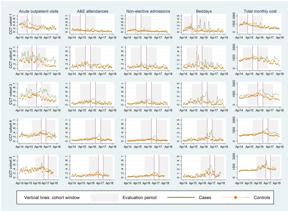
Trends in utilisation for CCT cases and controls: mean monthly utilisation

1 2 3 4 5 6 7 8 9 10 11 12 13 14 15 16 17 18 19 20 21 22 23 24 25 26 27 28 29 30 31 32 33 34 35 36 37 38 39 40 41 42 43 44 45 46 47 48 49 50 51 52 53 54 55 56 57 58 59 60