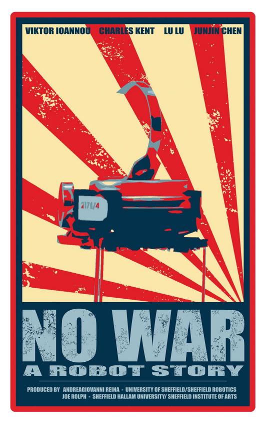
Fig. 1. Poster of the film "No War: A Robot Story" designed by V. Ioannou.

robot anthropomorphism in the audience [18], [19], as we ultimately wish to picture the robots positively.